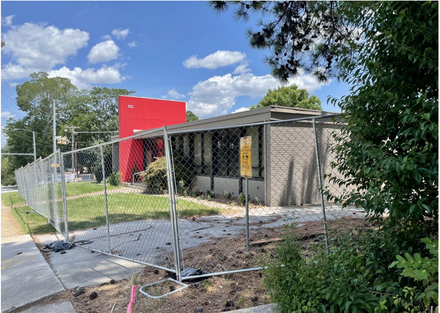
Rocky Mount, N.C.-based First Carolina Bank is opening a Greenville branch by the end of 2022 at 522 N. Church St. It is the bank's second South Carolina location, with the first opening earlier this year in Columbia.